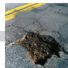
POTHOLE/ DAMAGED PAVEMENT